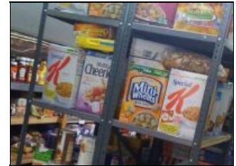
Westport food pantry adds Saturday hours

Printable Version Email This Share 0 0 tweet