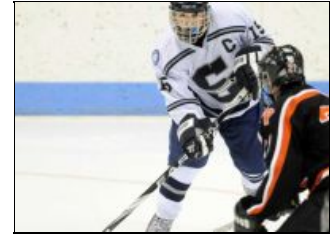
Wrecker icemen enjoyed successful run

For more information on how to register to become an organ and tissue donor, log onto http://www.donatelifenewengland.org .