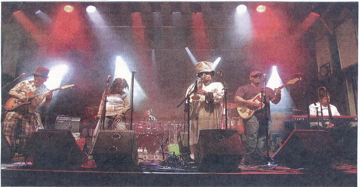
The band Deep Banana Blackout plays at this summer's Gathering of the Vibes in Bridgeport.